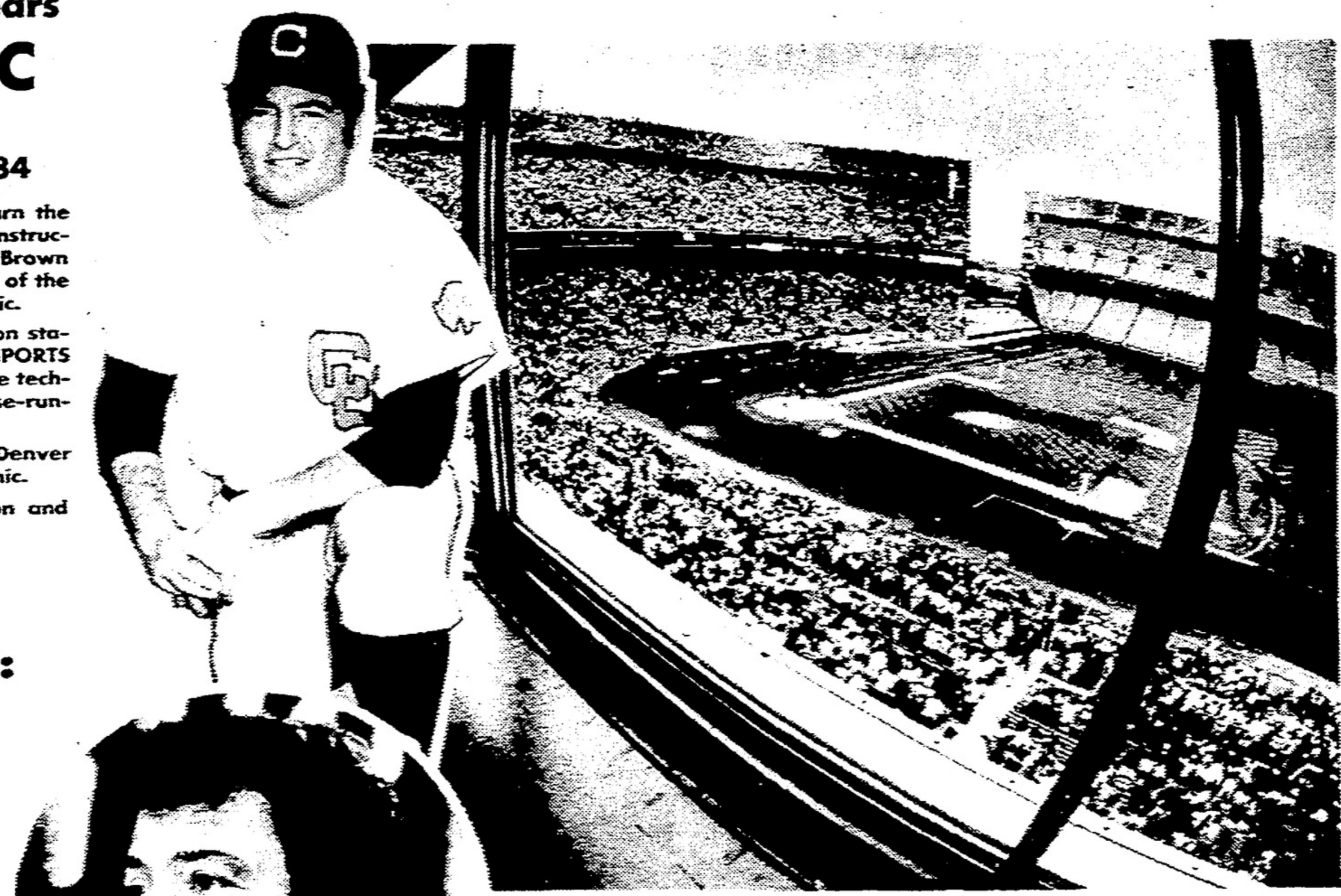
Denver's Mile High Stadium.